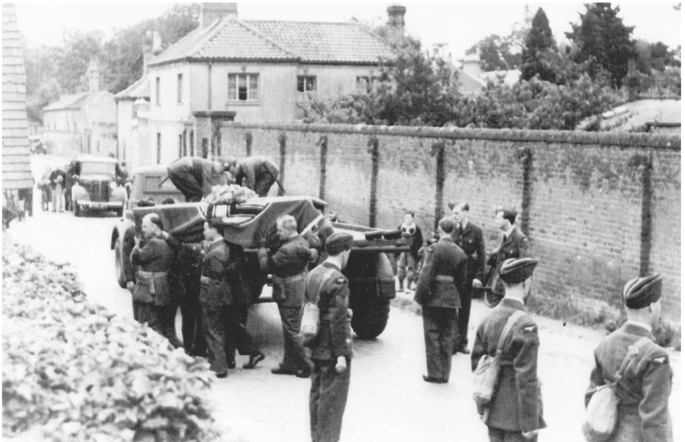
The burial of Oberfw. W. Stolle and Lt. H. Kruger in St Margaret's Church, Old Catton

It is not clear exactly when or where the last three pilots were recovered, but it is assumed that they were found some distance from the original crash site and at a later date. As such they would have been buried in the nearest cemetery with a service connection.