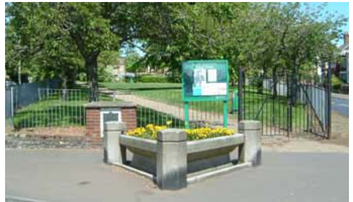
The memorial to Anna Sewell at the bottom end of the field where Bessie probably once roamed.

In 1854 Maria Louisa Charlesworth published her Victorian best-selling book "Ministering Children". This was an uplifting moral work that featured a beloved horse called "Black Beauty" as a character. This childhood reading, a combination of many years observing, drawing, riding and travelling with horses together with the inspiration of Bessie probably planted a seed. Anna started writing the Black Beauty book at her home in Old Catton in 1871. It was to be her increasingly failing health and her inability to leave the house in Old Catton that probably stirred Anna into writing to keep herself mentally active.