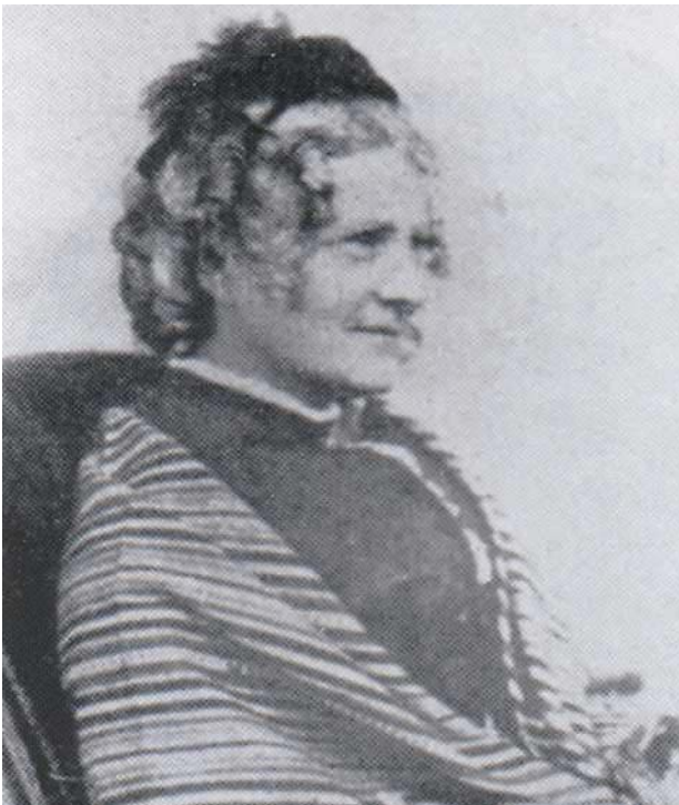
Anna Sewell at the about the time she wrote Black Beauty .

This desecration caused total outrage, but despite much effort, the graves were never re-established. Instead, the gravestones were cleaned and repaired. Anna's gravestone is set into a flint wall outside the old Quaker meeting house in Lammas. On either side of Anna's gravestone is that of her parents and her grandparents.