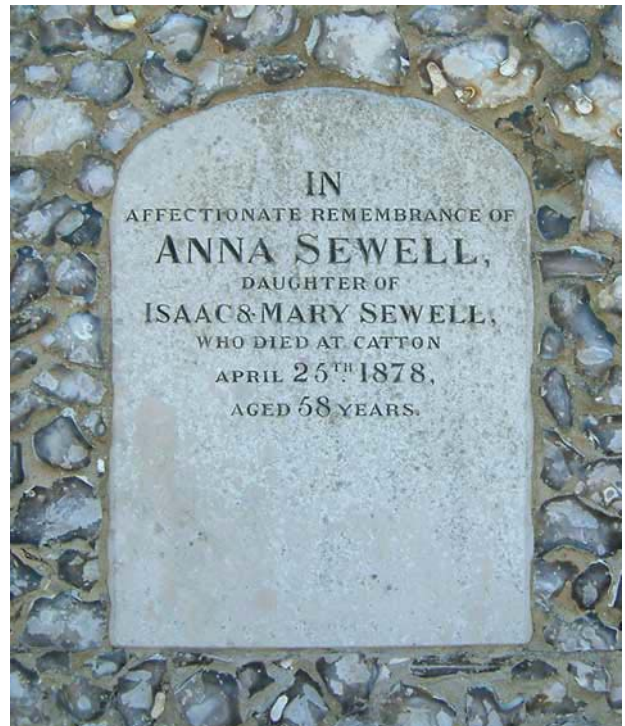
Anna Sewell's gravestone set into the wall at Lammas.