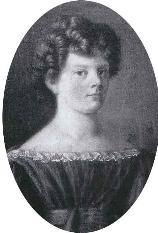
A portrait of Anna Sewell as a young lady.